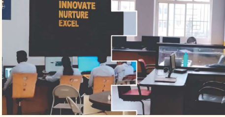
NIC at NMIET Campus