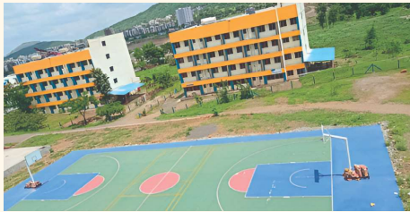
Sports (Basket Ball Ground)