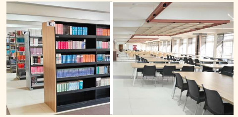
Library and Spacious Reading Hall.