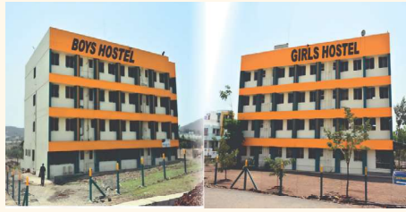
Boys & Girls Hostel in Campus