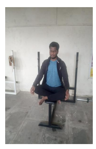
No. of Participants: - 20+