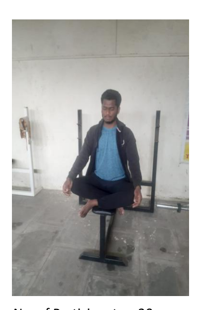
No. of Participants: - 20+